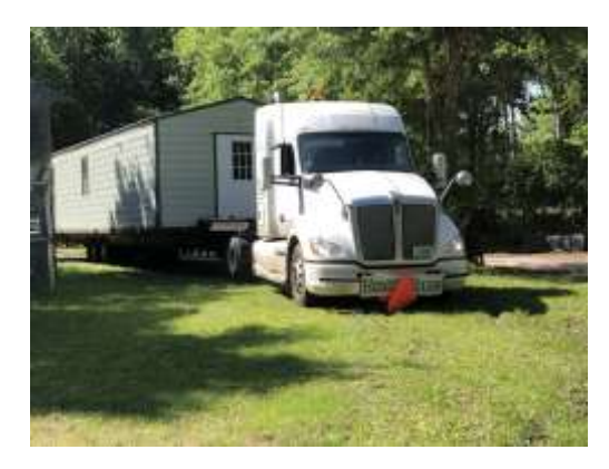
Hurricane Shelter Delivery

We remain steadfast in our commitment to the monkeys who call Jungle Friends their forever home. <u>Will you help us to</u> protect them during tropical storms and hurricanes – the <u>MOST violent storms on the planet?</u>